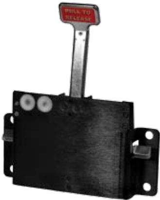
EN1789 rated charging/retention bracket. Holds to a force of 10G and conducts vehicle power to run and charge the unit.

The S-SCORT® VX-2® is a portable, powerful battery powered suction unit that can be mounted in the action area of an ambulance and used as onboard suction. The optional charging/retention bracket connects the VX-2 to vehicle power at all times. With its variable regulator and gauge, outward facing controls, and drawing its power from the vehicle, the VX-2 is set-up for on-board suction. If portable suction is required at the scene, the VX-2 can easily