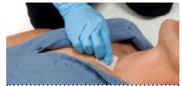
Swab the insertion site

Point out that it is midline, just below sternal notch with Target Zone over manubrium.