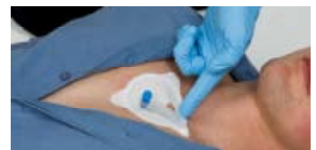
Place Target Patch