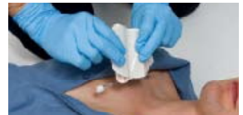
Pull tabs off Target Patch